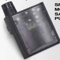
SP6 MOTORIZED SAMPLING PUMP