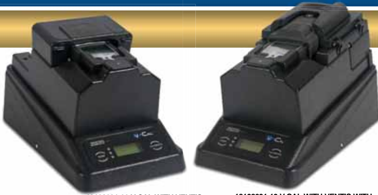
18108631-00 V-CAL WITH VENTIS INSTRUMENT* (*monitor not included)