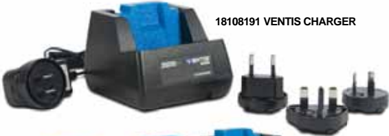
18108191 VENTIS CHARGER