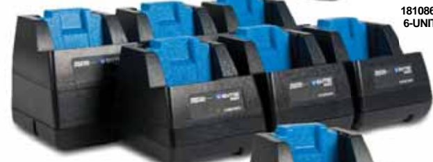
18108650-0 6-UNIT CHARGER