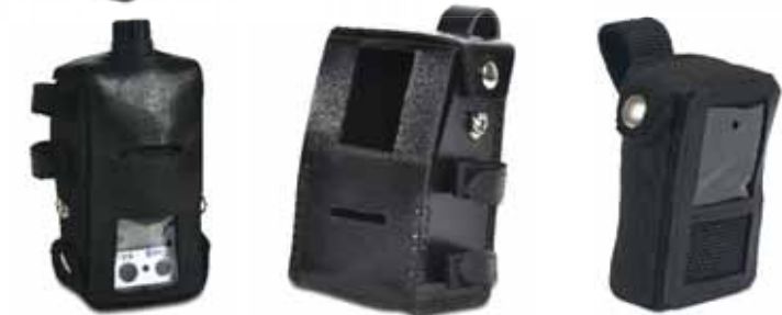
18108810 VENTIS WITH PUMP SOFT CARRYING CASE