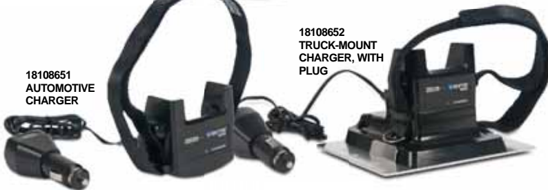
18108651 AUTOMOTIVE CHARGER